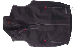
BREATHABLE SARDINIA GILET - SB0120 BLACK, NAVY, PLATINUM, SURF