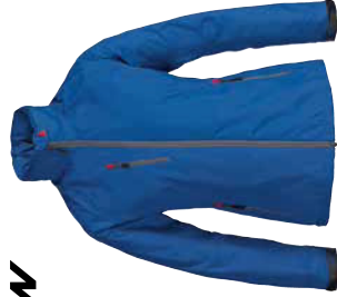
WOMEN'S BREATHABLE SARDINIA JACKET SB0100W SURF, BLACK, NAVY, PLATINUM