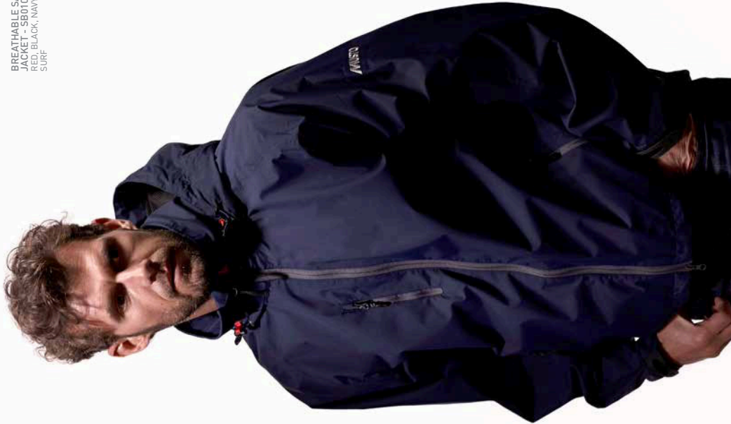
BREATHABLE SARDINIA JACKET - SB0100 RED, BLACK, NAVY, PLATINUM, SURF