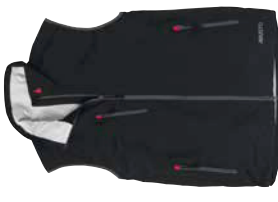
BREATHABLE CORSICA GILET - SB0150 BLACK, NAVY, PLATINUM, SURF