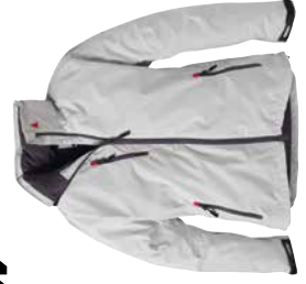
WOMEN'S BREATHABLE CORSICA JACKET - SB0140W PLATINUM, BLACK, NAVY, SURF