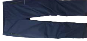
BREATHABLE SARDINIA TROUSERS - SB0110 NAVY, BLACK