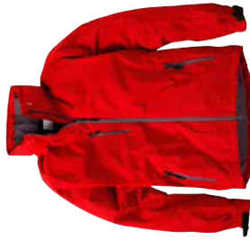
BREATHABLE CORSICA JACKET - SB0140 NAVY, BLACK, PLATINUM, RED, SURF