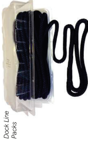
Dock Line Packs