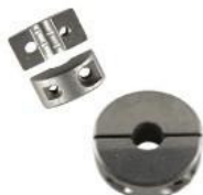
Wire Rope Stopper